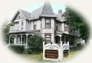
John Smart House

206 N. Elmwood Medina Ohio 44256 www.medinacountyhistoricalsociety.com mchs@zoominternet.net Established 1922